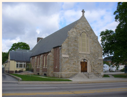
St. Paul's Ev. Lutheran Church